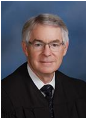
Probate Judge Alan King